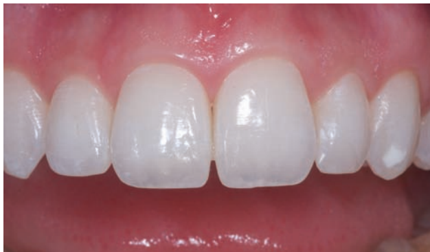
Figure 5. Close view after ABB at week 9.