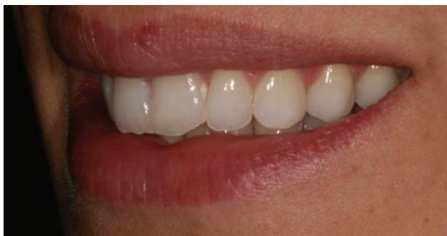
Figure 14. Side smile after alignment and whitening.