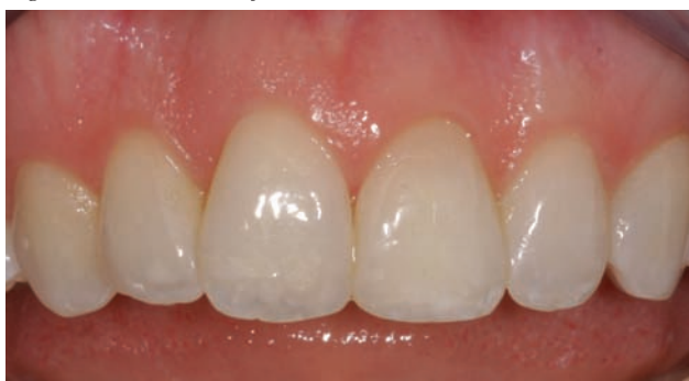
Figure 26. Close view after ABB at 12 weeks.

was simply filled with a nano-hybrid composite (Venus Diamond, Heraeus) for high polish. The composite was polished vertically using rubber sticks (PoGo, DENTSPLY DeTrey) to try to blend in with surface anatomy to mask the join. The process was repeated on the lateral.