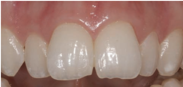
Figure 3. Close up view before.