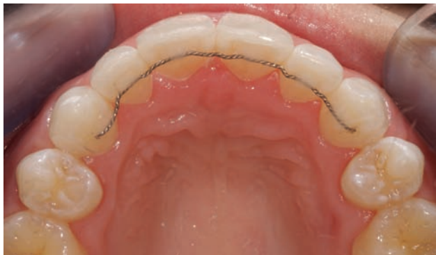
Figure 7. Occlusal view after.