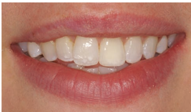
Figure 25. Smile view after ABB at 12 weeks.