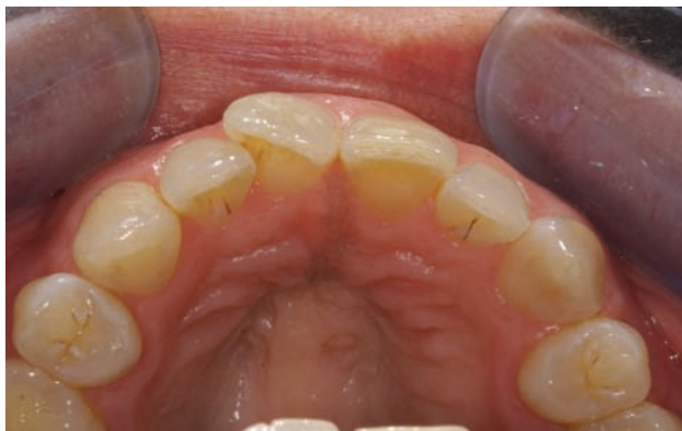
Figure 20. Occlusal view before.