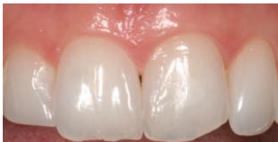
Figure 12. After Inman Aligner and whitening at 10 weeks.