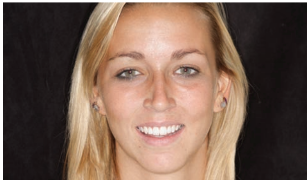
Figure 8. Full face view after.

reason for this was that because the laterals were being pushed out, the arch was being expanded, thus creating space.