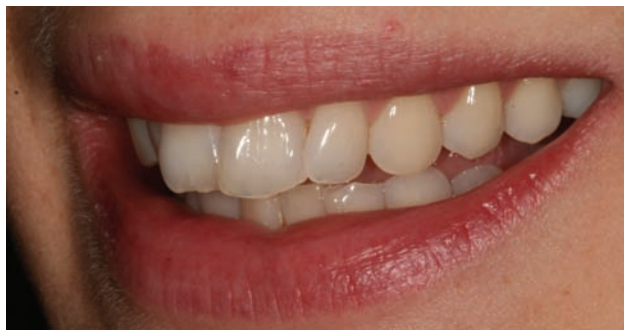
Figure 10. Before side smile view.