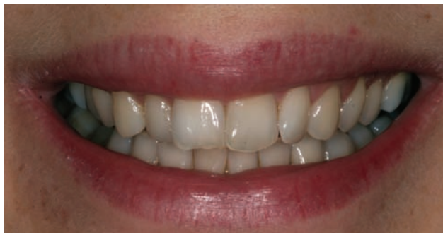
Figure 9. Before smile view.