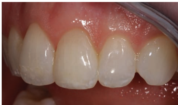
Figure 23. Close right side view after Edge bonding.