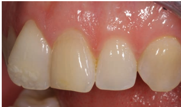
Figure 19. Close left side view before.