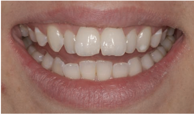
Figure 1. Smile View before treatment.