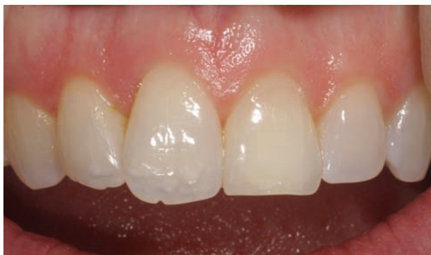
Figure 22. Close view after alignment and whitening at week 10.