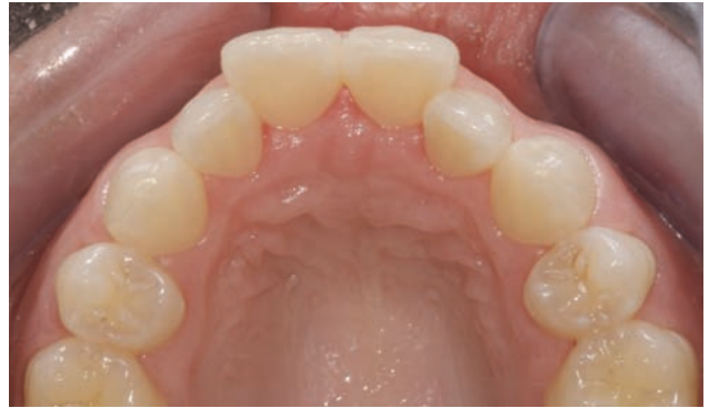
Figure 2. Occlusal view before.