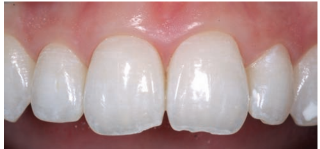
Figure 4. Close view after Inman Aligner and whitening at week 9.

suggested changes in their mouth. One can question the ethics of allowing patients to commit to a potentially irreversible procedure based on 2-D photographs.