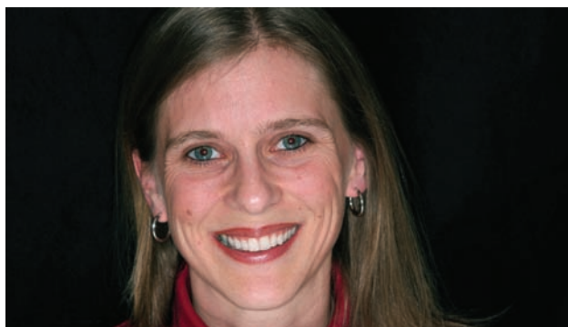
Figure 17. Full face view after.

model to create a tight dam effect. Over two weeks, her teeth whitened nicely and at week ten, she returned for a review.