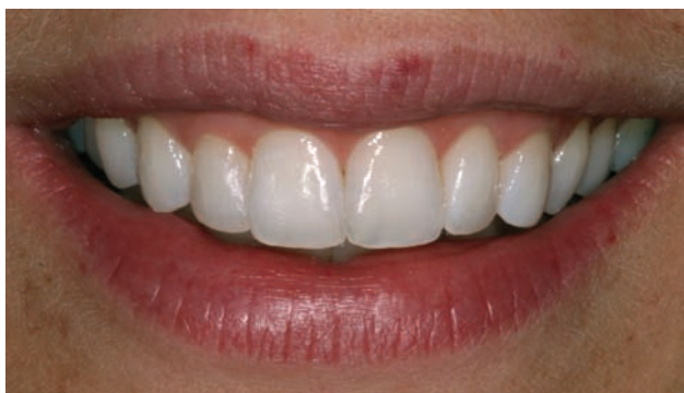
Figure 16. Smile view after ABB.