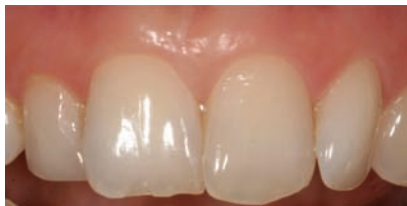
Figure 11. Before close up view.